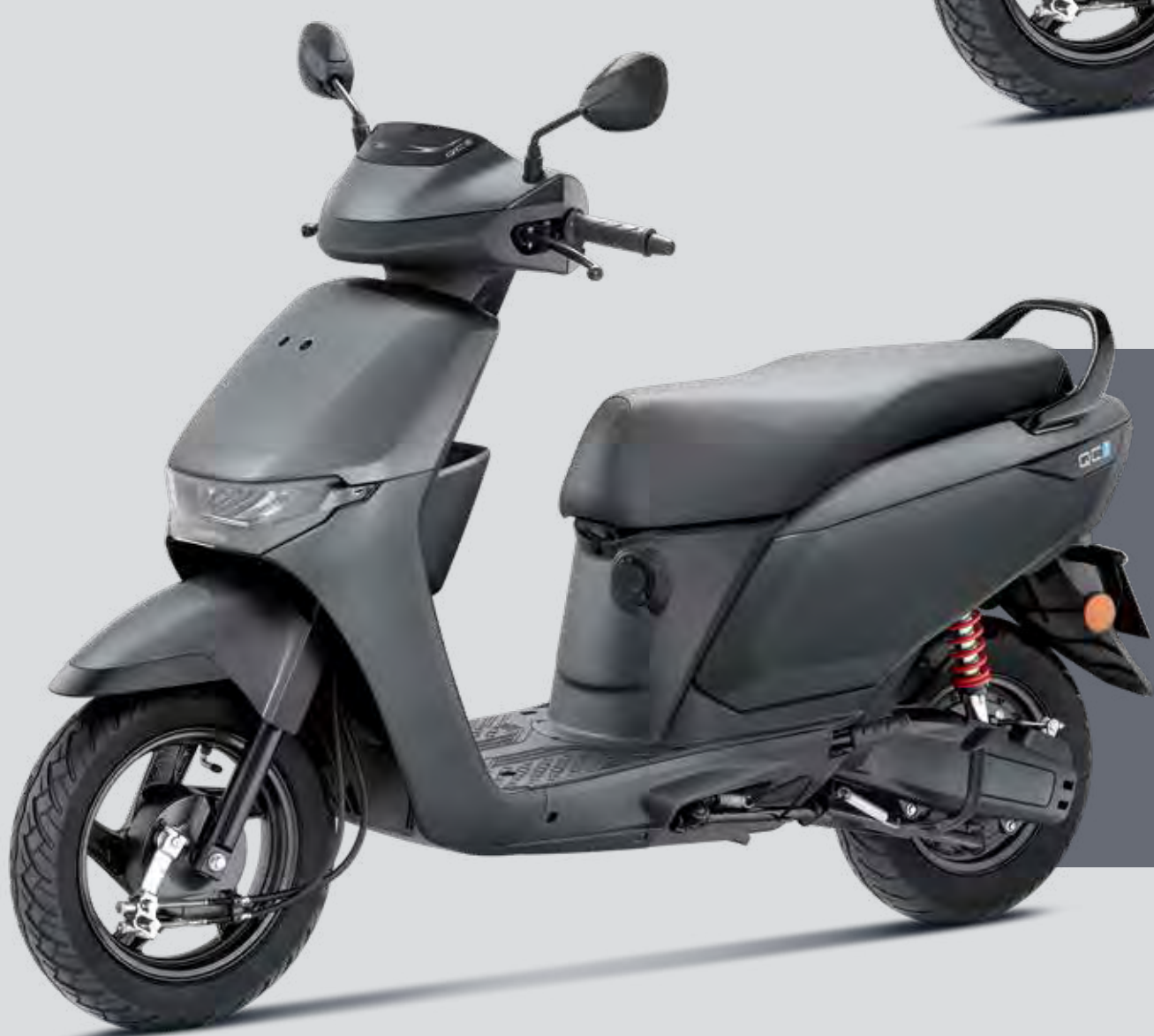
Matt Foggy Silver Metallic

*Products shown in the pictures may vary from actual products available in the market. All features and colours may not be a part of all variants. Accessories shown in the pictures are not a part of standard equipment. For creative visualisation only.