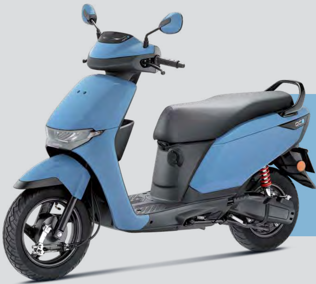
Pearl Serenity Blue

Choose from a range of stunning colours that reflect your personality.