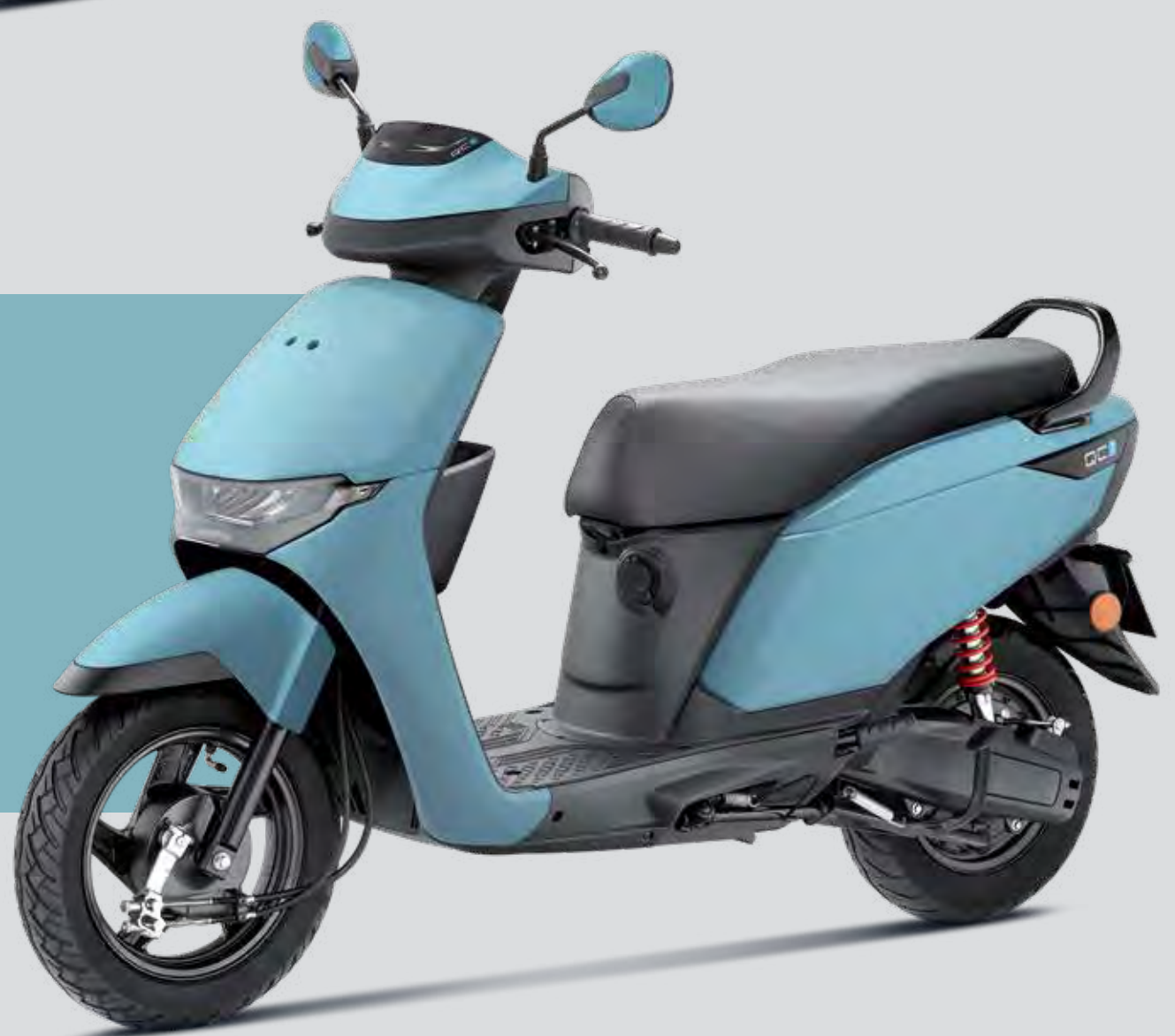
Pearl Shallow Blue