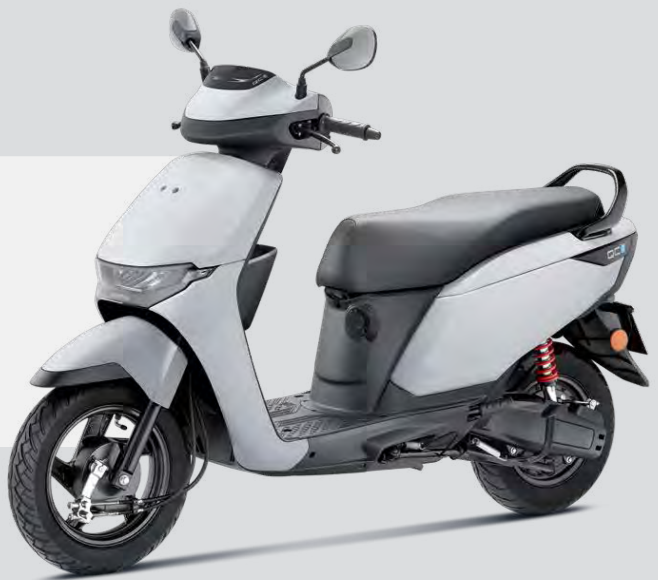
Pearl Misty White